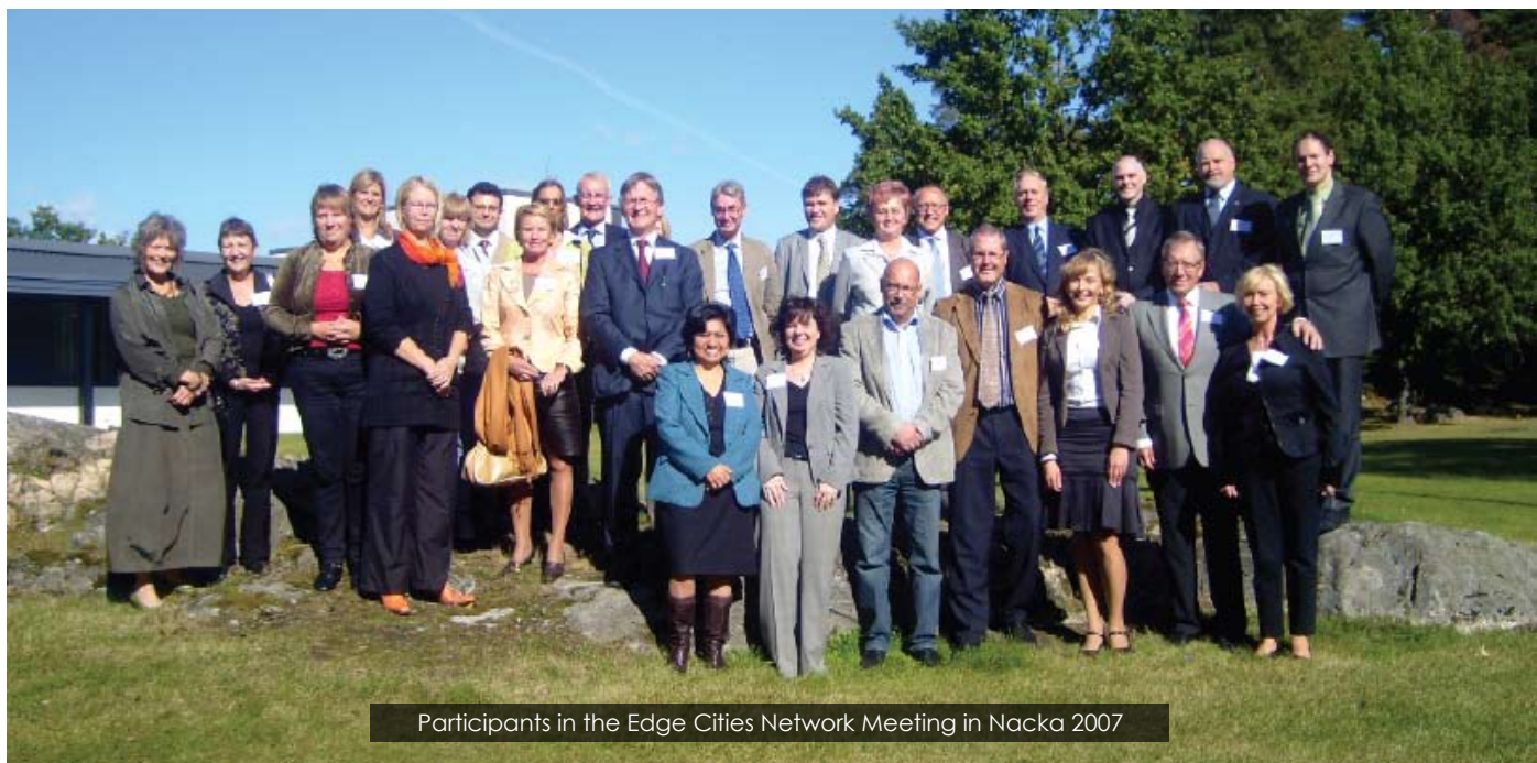
Participants in the Edge Cities Network Meeting in Nacka 2007