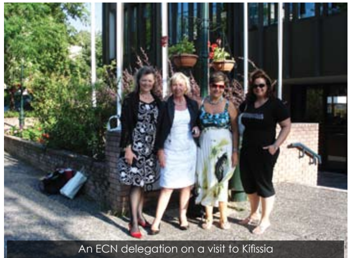
An ECN delegation on a visit to Kifissia