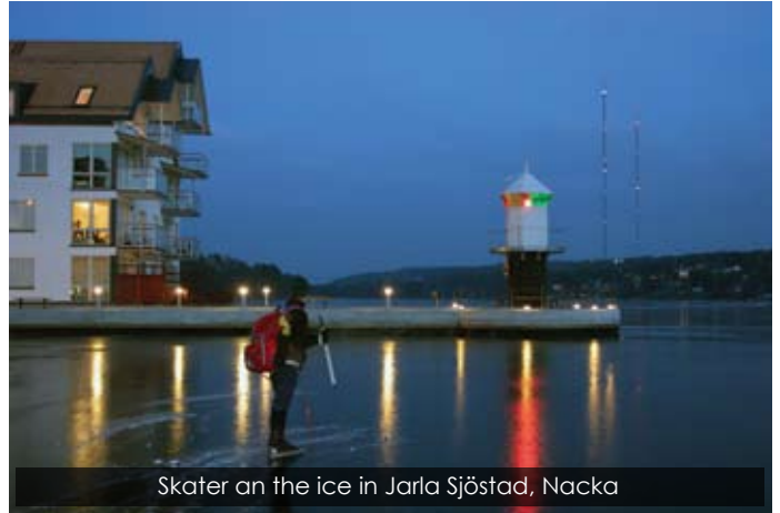
Skater on the ice in Jarla Sjöstad, Nacka