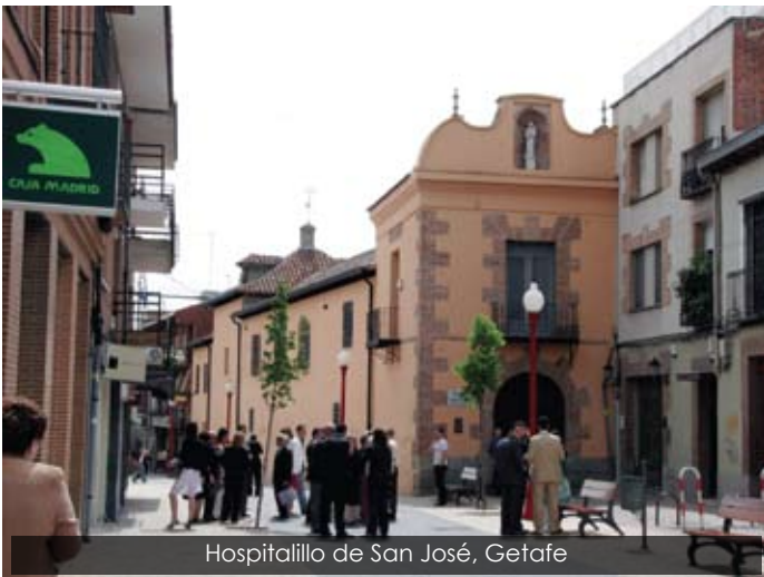
Hospitalillo de San José, Getafe