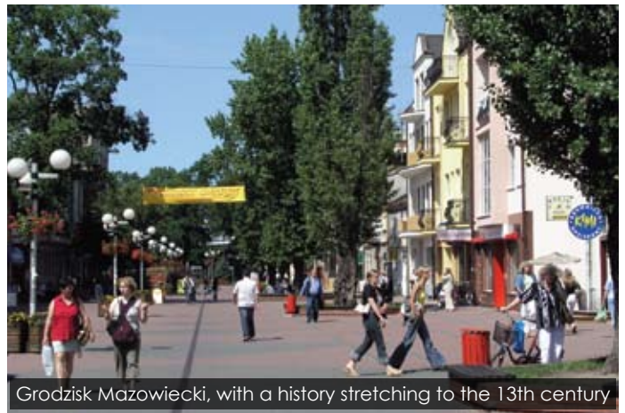
Grodzisk Mazowiecki, with a history stretching to the 13th century