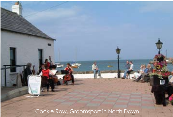
Cockle Row, Groomsport in North Down

EDGE CITIES NETWORK MEETS TWICE A YEAR FOR DAYS OF KNOWLEDGE SHARING, DISCUSSIONS, FUTURE PLANNING, INSIGHTS — AND VALUABLE STUDY VISITS.