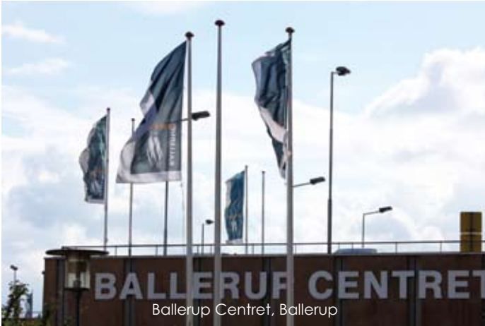
Ballerup Centret, Ballerup