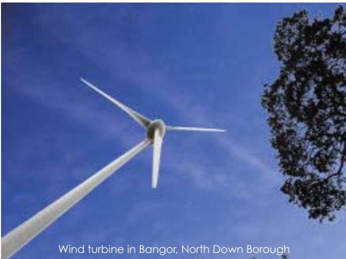
Wind turbine in Bangor, North Down Borough