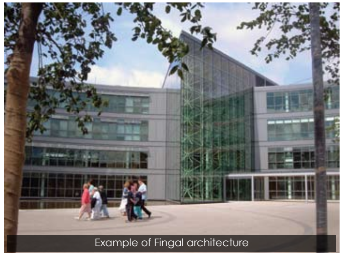
Example of Fingal architecture

EDGE CITIES NETWORK MEETS TWICE A YEAR FOR DAYS OF KNOWLEDGE SHARING, DISCUSSIONS, FUTURE PLANNING, INSIGHTS — AND VALUABLE STUDY VISITS.